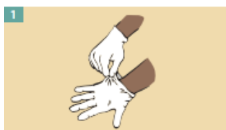
1 Grasp the outside of one glove at the wrist. Do not touch your bare skin.