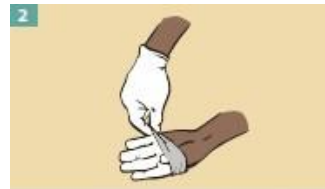
2 Peel the glove away from your body, pulling it inside out.