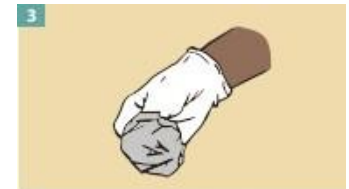
3 Hold the glove you just removed in your gloved hand.