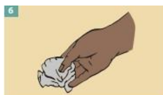
6 Dispose of the gloves safely. Do not reuse the gloves.