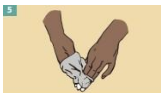
5 Turn the second glove inside out while pulling it away from your body, leaving the first glove inside the second.