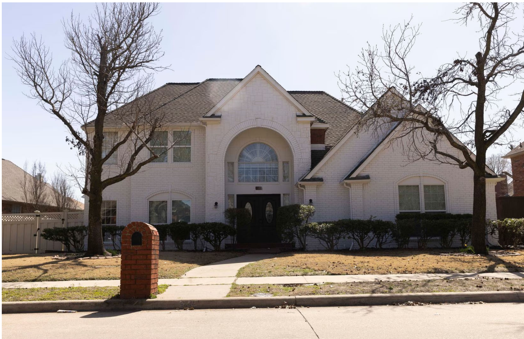
The exterior of the short-term rental on Cannes Drive where a shooting occurred early Sunday morning photographed in Plano on Monday, Feb. 27, 2023.

Before the shooting, several neighbors had already called police with noise complaints concerning a party happening at the home.