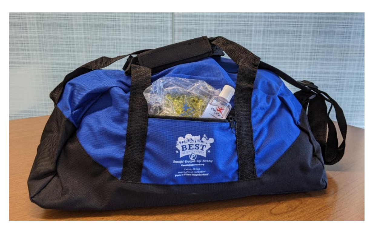
Duffle bag for each participant